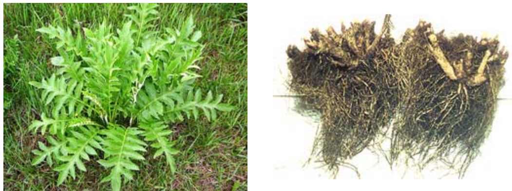
Fig. 1. R. carthamoides : at the left - the above-ground part consisting of rosulate shoots, on the right – root system (a rhizome with adventitious roots)

ground part of plants is located in 0-30 cm soil layer; it consists of rhizome and the main root with numerous rigid thin adventitious and lateral roots in length till 25-40 cm.